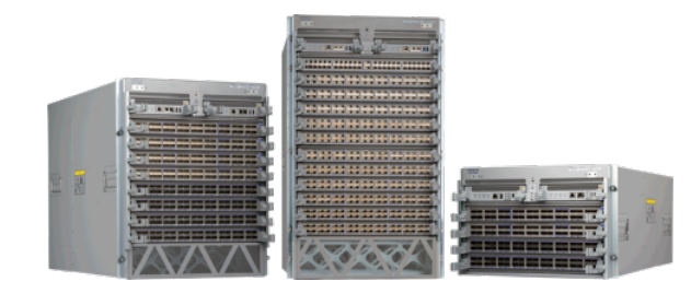
Arista 7500R3 Series Modular Data Center Switches

All components are hot swappable, with redundant supervisor, power, fabric and cooling modules with front-to-rear airflow. The system is purpose built for data centers and is energy efficient with typical power consumption of under 25 watts per 100G port for a fully configured chassis. These attributes make the Arista 7500R3 an ideal platform for building reliable and highly scalable data center networks.