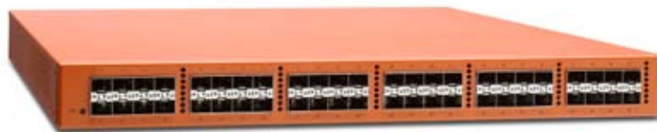
Fig 2. RD-CX-48XG - Prestera CX 48 port 10GbE (SFP+) Reference Design

To shorten system manufacturer design cycles and accelerate time-to-market, Marvell provides complete Prestera CX development platforms and reference designs with device drivers, schematics, layout files and other documentation. Software and hardware solutions based on the Prestera CX platform are available from third-party vendors.