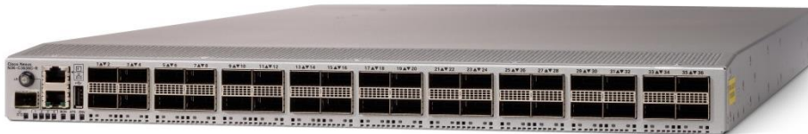
Figure 1. Cisco Nexus 3636C-R switch

The 3636C-R (Figure 1) is a Quad Small Form-Factor Pluggable (QSFP) switch with 36 QSFP28 ports. Each QSFP28 can operate at 100 or 40 Gigabit Ethernet or in a breakout cable configuration.