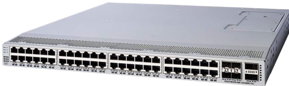
Figure 4. Cisco Nexus 9348GC-FX3 Switch

The Cisco Nexus 9348GC-FX3 Switch (Figure 4) is a 1RU switch that supports 696 Gbps of bandwidth and over 517 Mpps. The 48 1GBASE-T downlink ports on the 9348GC-FX3 can be configured to work as 10-Mbps, 100-Mbps, or 1-Gbps ports. The 4 ports of SFP28 can be configured as 1/10/25-Gbps and the 2 ports of QSFP28 can be configured as 40- and 100-Gbps ports, or a combination of 10-, 25-, 40, 50-, and 100-Gbps connectivity, offering flexible migration options.