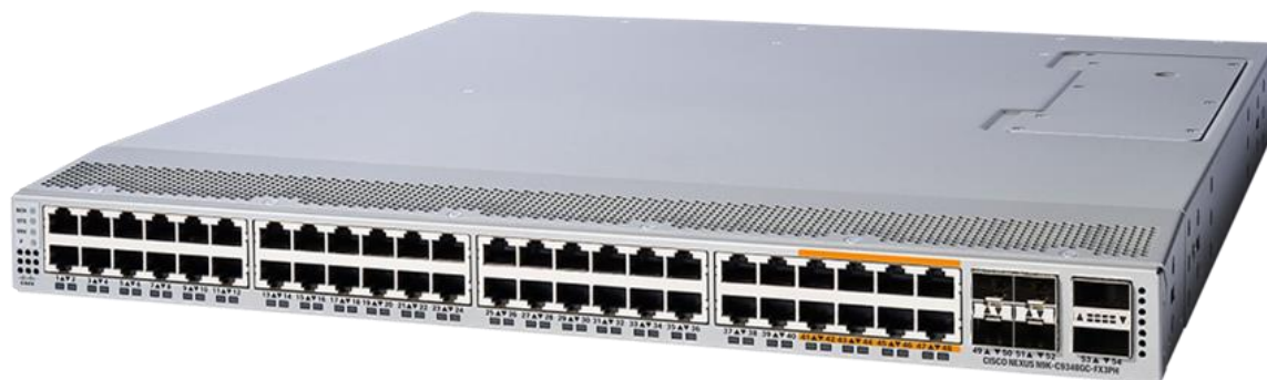
Figure 5. Cisco Nexus 9348GC-FX3PH Switch

The Cisco Nexus 9348GC-FX3PH Switch (Figure 5) is a 1RU switch that supports 696 Gbps of bandwidth and over 517 Mpps. The 40 1GBASE-T downlink ports on the 9348GC-FX3PH can be configured to work as 10-Mbps, 100-Mbps, or 1-Gbps ports. The last 8 downlink ports can be configured to work as 10-Mbps or 100-Mbps only. The 4 ports of SFP28 can be configured as 1/10/25-Gbps, and the 2 ports of QSFP28 can be configured as 40- and 100-Gbps ports, or a combination of 10, 25, 40, and 100-Gbps connectivity, offering flexible migration options. The last 8 ports are only of half-duplex functionality and are limited to 10Mbps and 100Mbps speeds only.