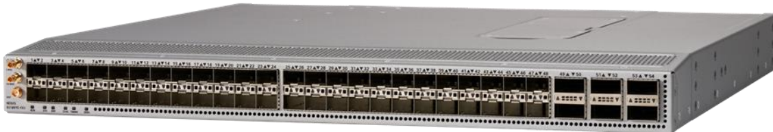
Figure 1. Cisco Nexus 93180YC-FX3 Switch

The Cisco Nexus 93180YC-FX3 Switch (Figure 1) is a 1RU switch that supports 3.6 Tbps of bandwidth and 1.2 Bpps. The 48 downlink ports on the 93180YC-FX3 are capable of supporting 1-, 10-, or 25-Gbps Ethernet, offering deployment flexibility and investment protection. The 6 uplink ports can be configured as 40 or 100-Gbps Ethernet, offering flexible migration options. The Cisco Nexus 93180YC-FX3 switch supports standard PTP telecom profiles with SyncE and PTP boundary clock functionality for telco data-center edge environments.