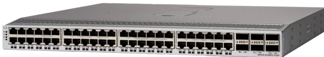
Figure 3. Cisco Nexus 93108TC-FX3P Switch

The Cisco Nexus 93108TC-FX3P Switch (Figure 3) is a compact 1 RU switch that supports 2.16 Tbps of bandwidth and 1.2 Billion packets per second (Bpps). Offering flexible port-speed configurations, the switch supports 48 ports of 100M/1/2.5/5/10G BASE-T on the downlinks. The 6 uplink ports support 40/100G QSFP 28. The 93108TC-FX3P is well suited for network customers requiring more versatility and flexibility in networking speeds.