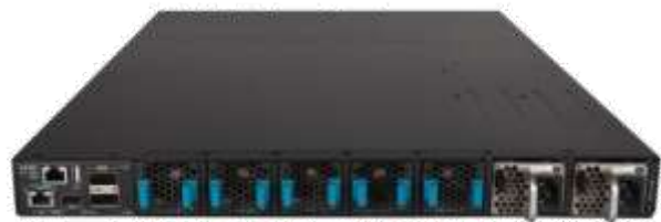
S6850-2C rear panel