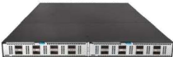
S6850-2C front panel